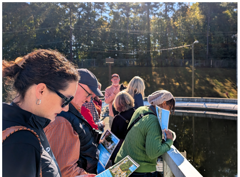
Government 101 participants tour the Wastewater Treatment Plant.

Tour participants must be at least 10 years old. Adults must bring a valid identification card, which can be a current passport, driver's license or state- or county-issued identification card.